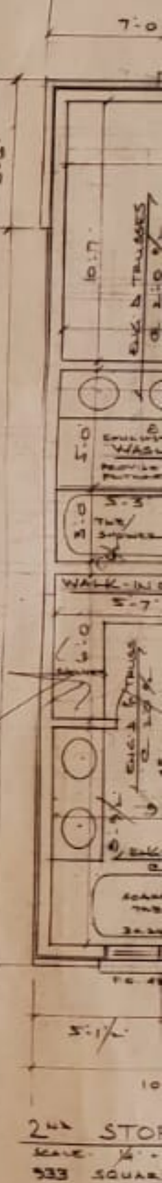
2nd STOR SCALE: 1/4" = 1'-0" 933 SQUARE