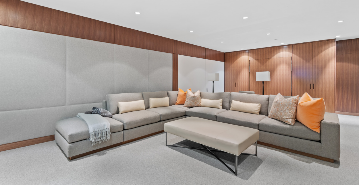
Lower Floor - 1,772 sq.ft. Ceiling height - 8' 7"