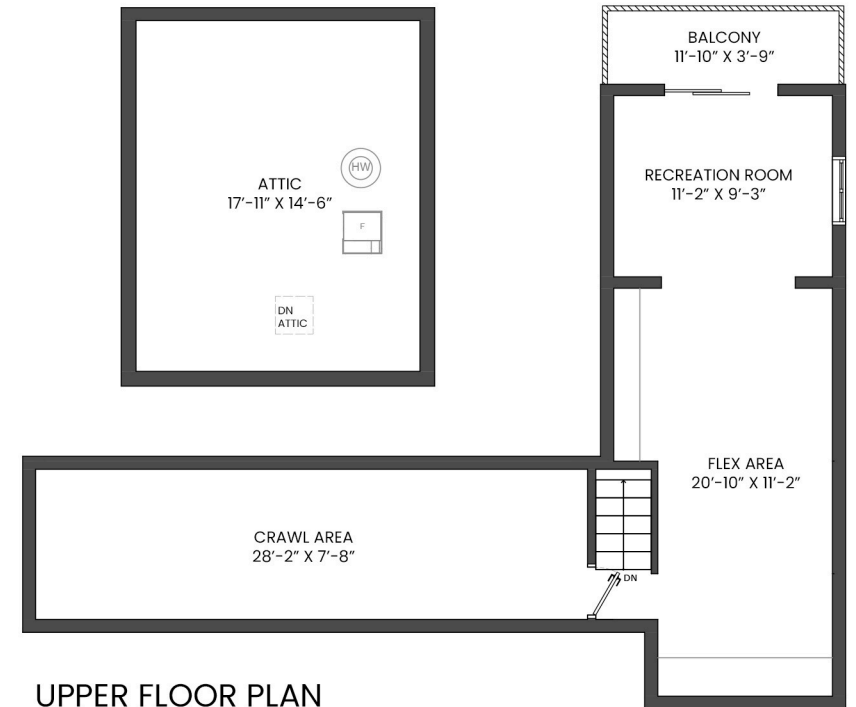
UPPER FLOOR PLAN Ceiling Height: 7'-8"