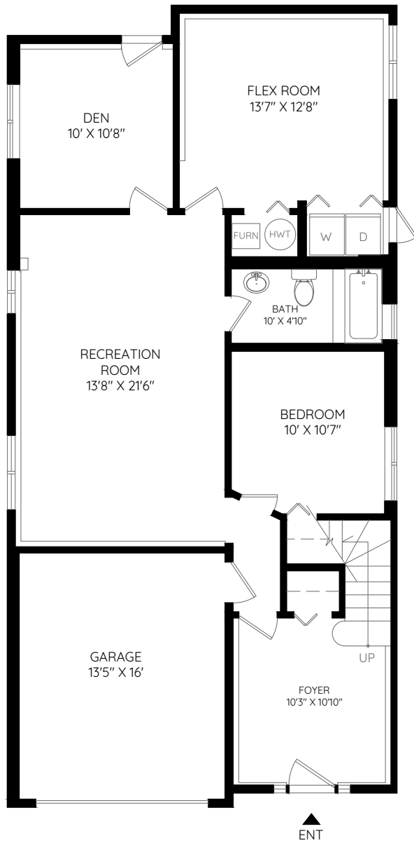
BASEMENT 1,029 SQ.FT. CEILING HEIGHT: 8'

charlie@charliecameron.com www.charliecameron.com