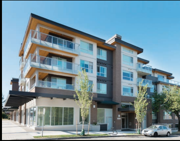
SESAME - VANCOUVER, BC