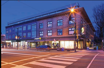
SHAUGHNESSY MANSIONS - VANCOUVER, BC