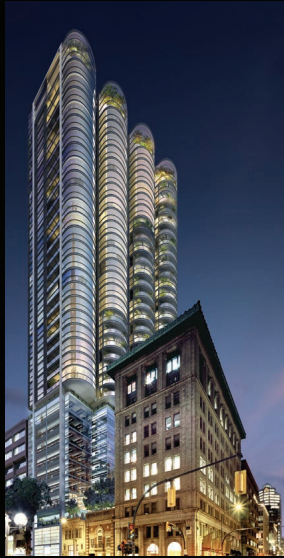
JAMESON HOUSE - VANCOUVER, BC