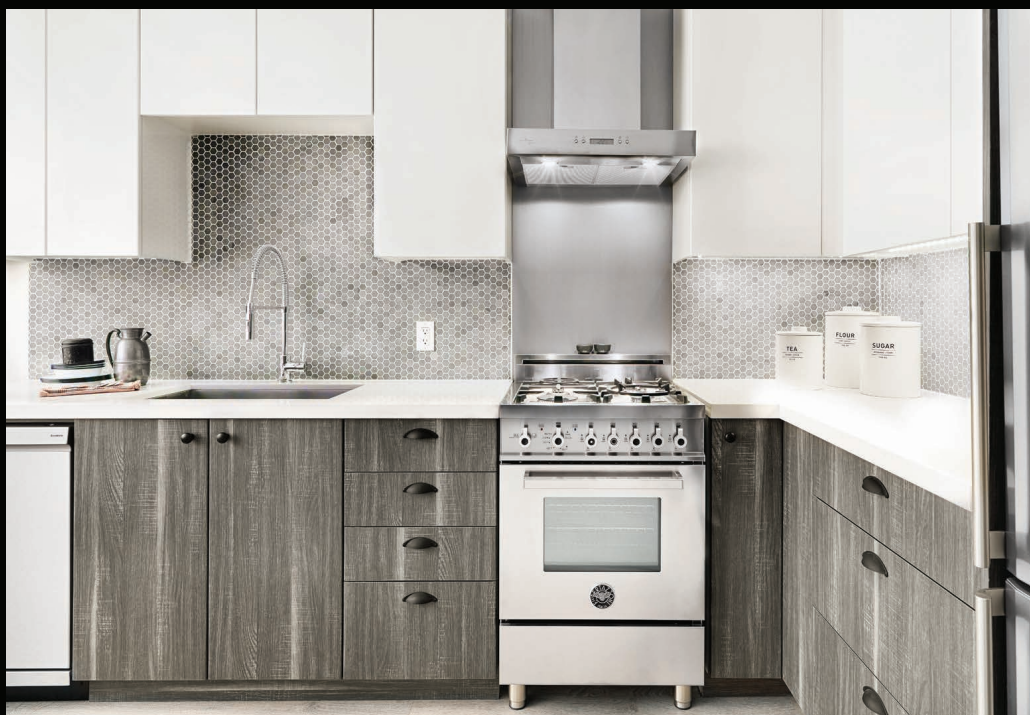
HIGH END FINISHES WITH ORIGINAL STYLE