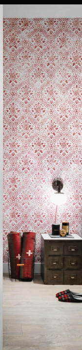
BOUTIQUE HOMES STYLED FOR HOW YOU LIKE TO LIVE