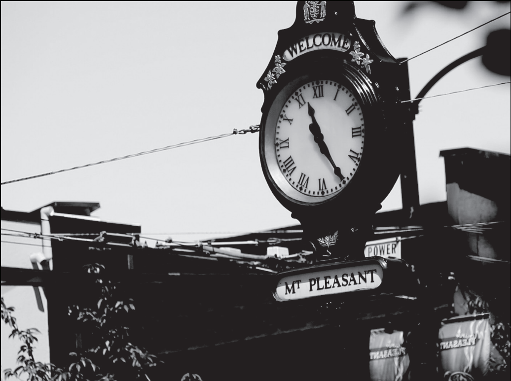
THEN AND NOW

HERE'S TO HAVING BELIEF AND COURAGE IN WHAT YOU MAKE.