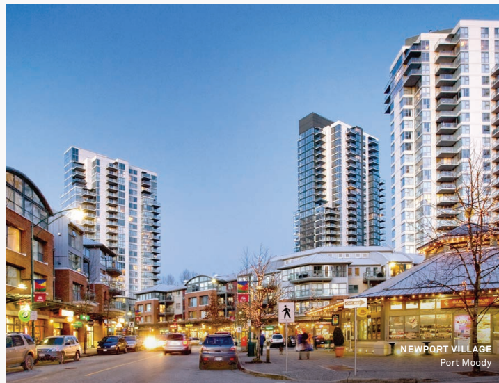
NEWPORT VILLAGE Port Moody