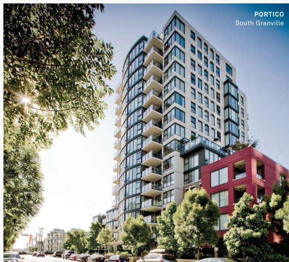
PORTICO South Granville

DYNAMIC, DESIRABLE COMMUNITIES THAT BRING PEOPLE TOGETHER. BUILT BY BOSA DEVELOPMENT.