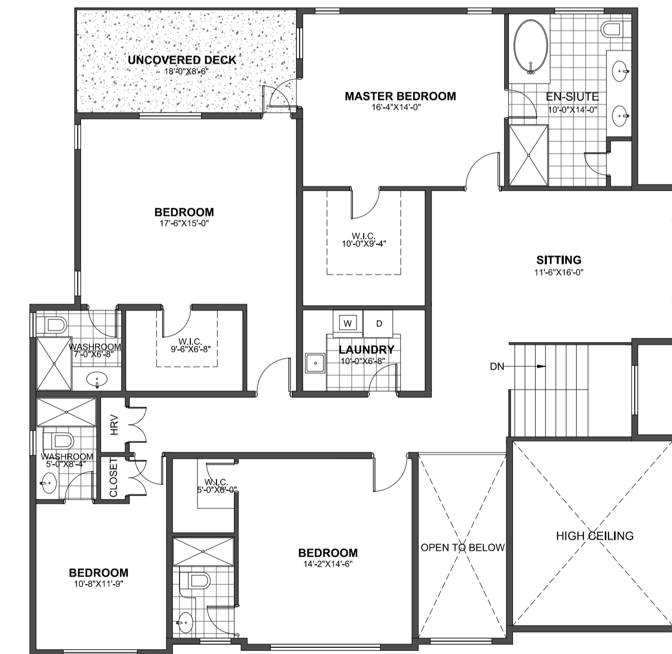
UPPER FLOOR PLAN FLOOR AREA 1999.00sq.ft