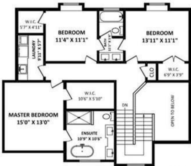
UPPER FLOOR: 1163 SQ.FT.