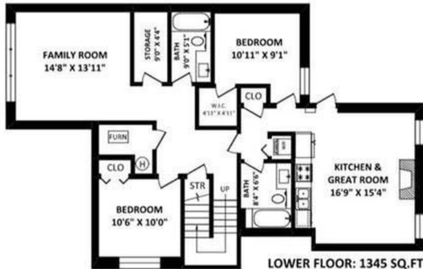
LOWER FLOOR: 1345 SQ.FT.