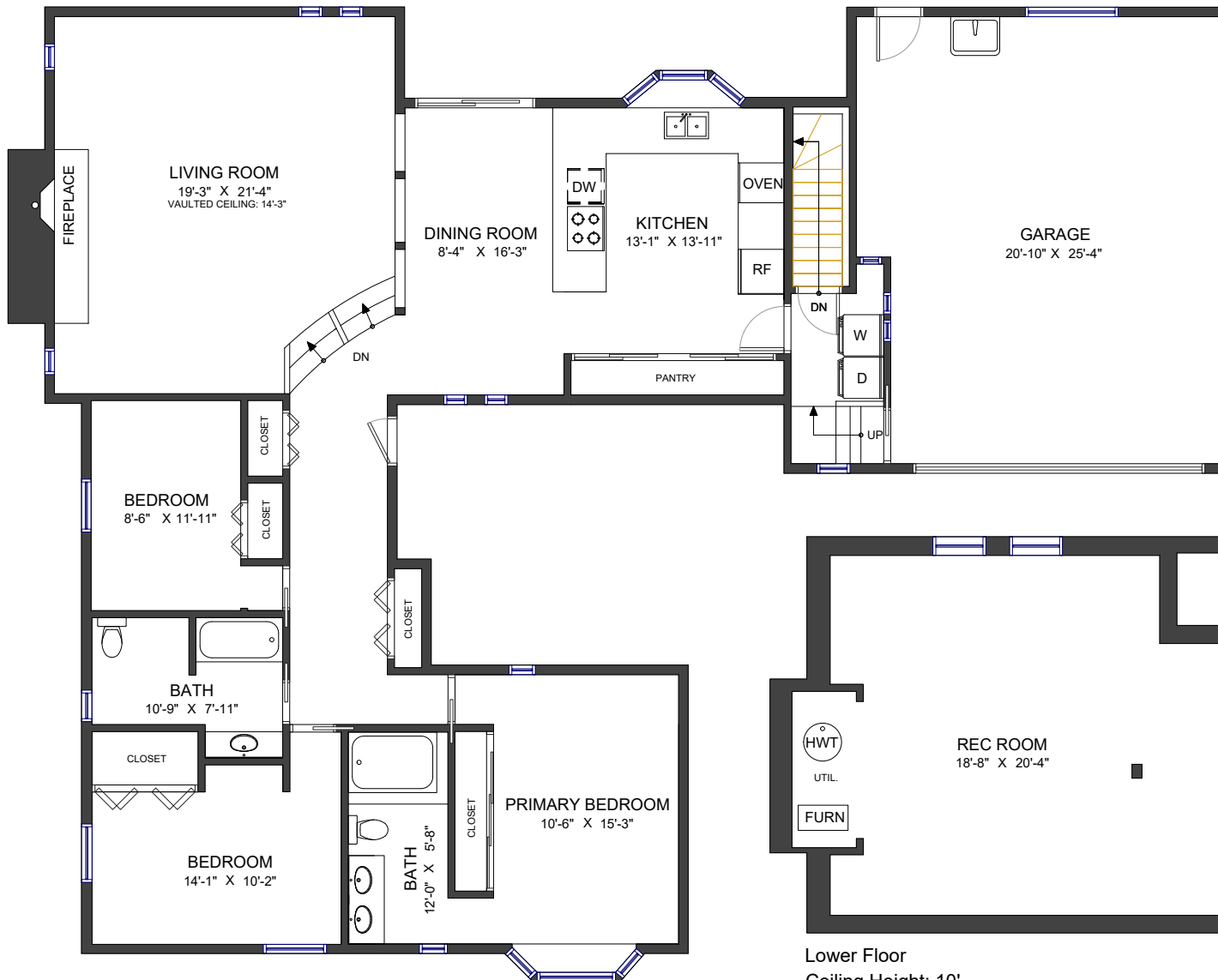
Main Floor Vaulted Ceiling: 14'-3"

604.771.3495 | adil@dinani.ca www.dinani.ca | Royal LePage