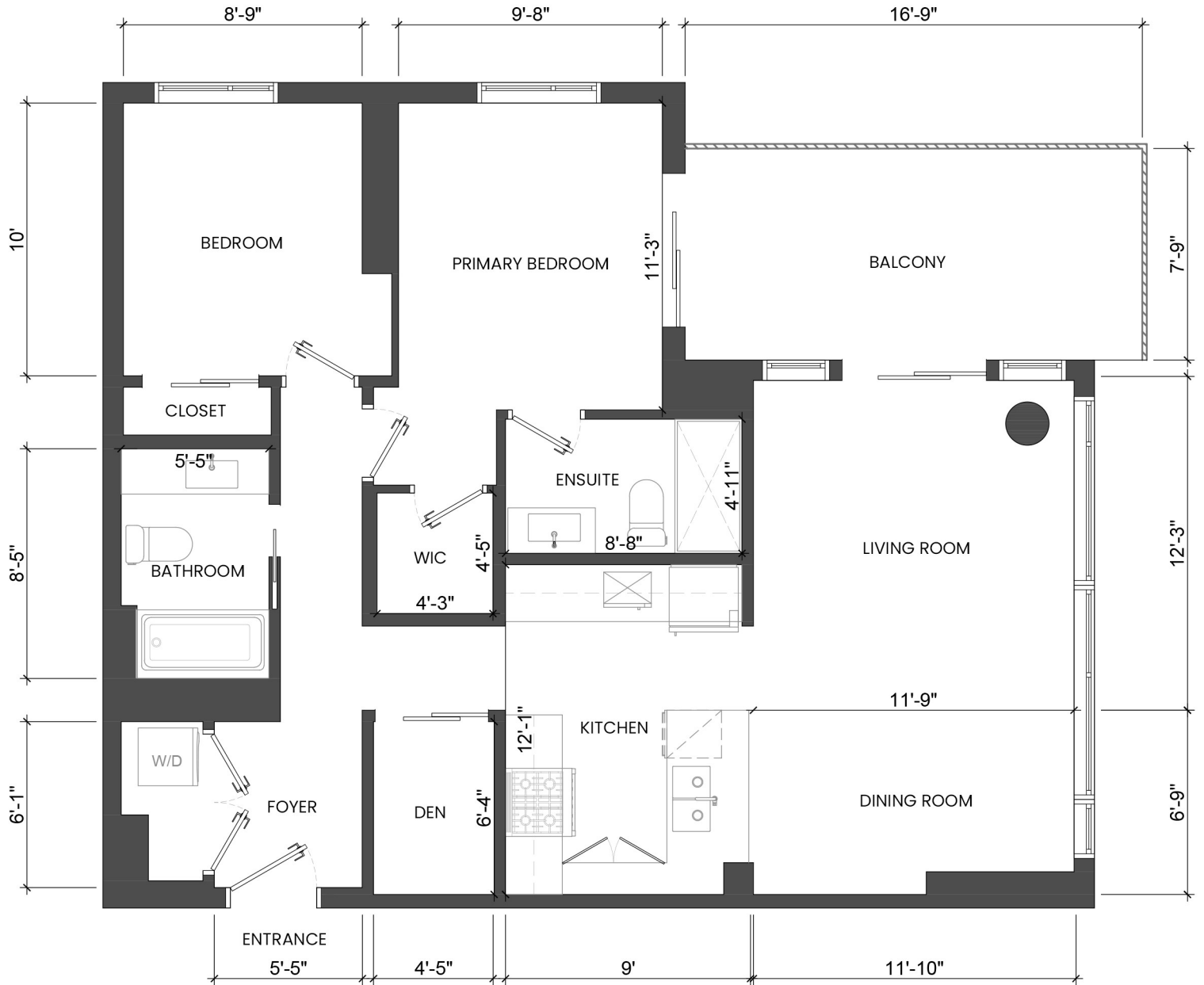
MAIN FLOOR PLAN Ceiling Height: 8'-4"