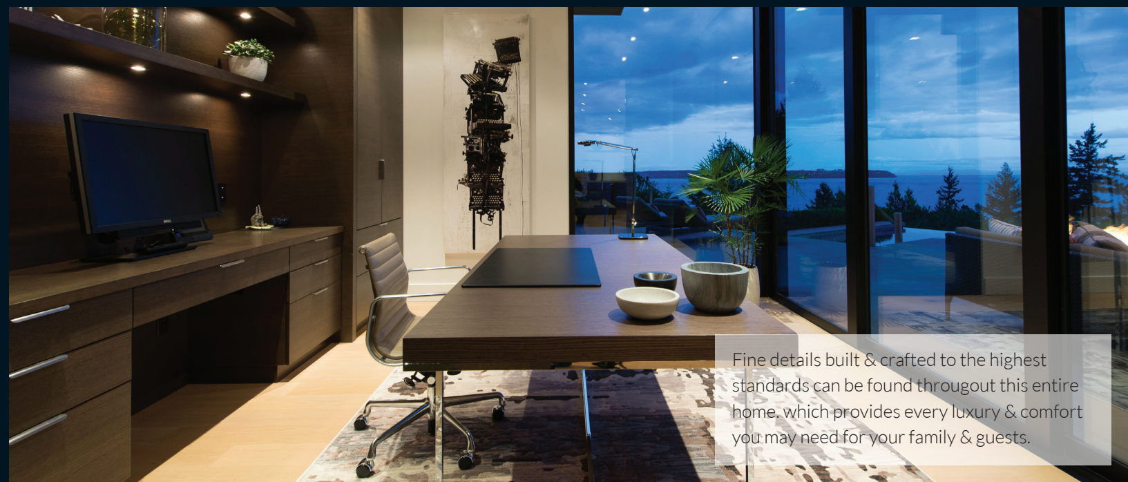
Fine details built & crafted to the highest standards can be found throughout this entire home, which provides every luxury & comfort you may need for your family & guests.