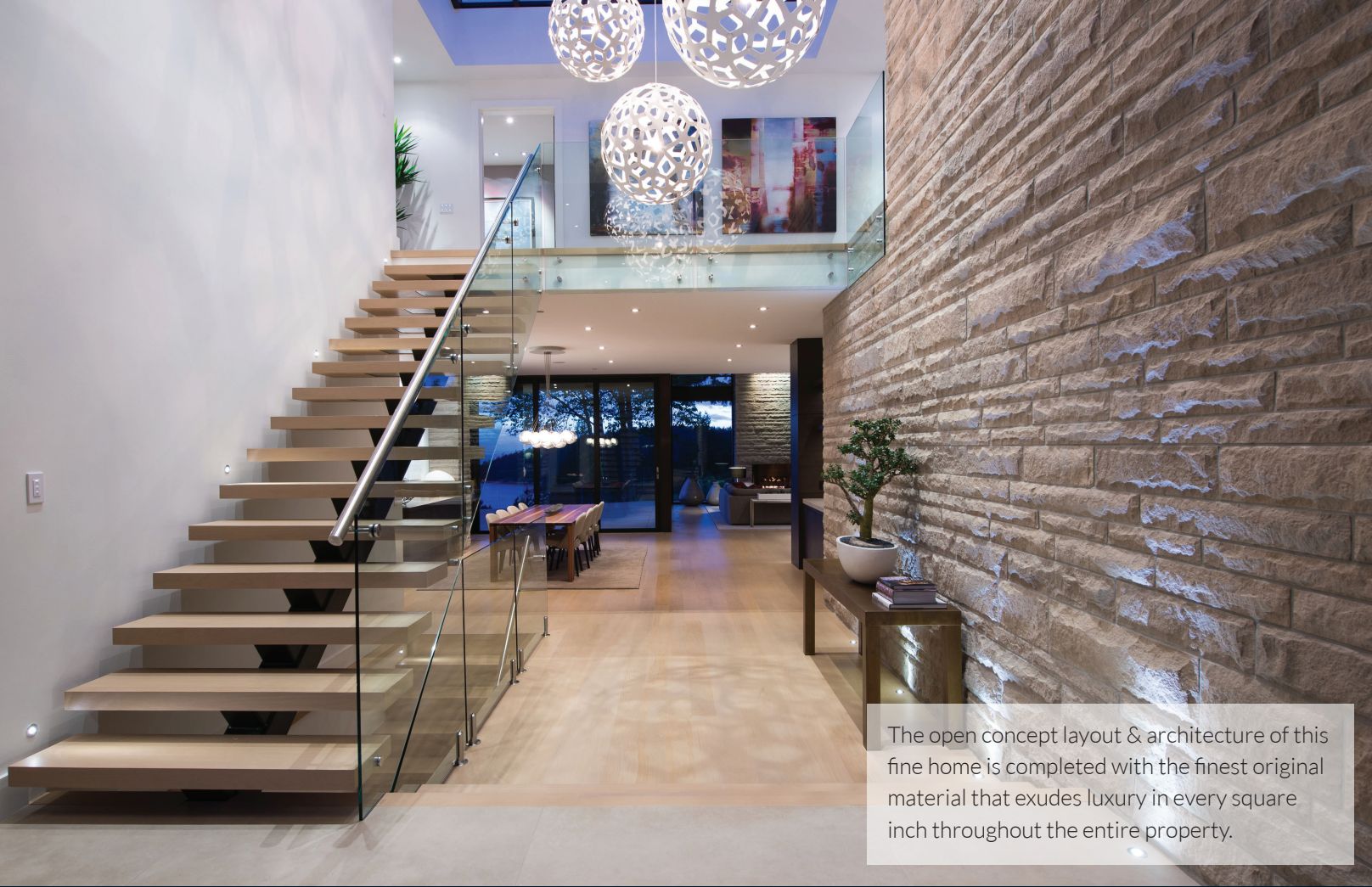
The open concept layout & architecture of this fine home is completed with the finest original material that exudes luxury in every square inch throughout the entire property.