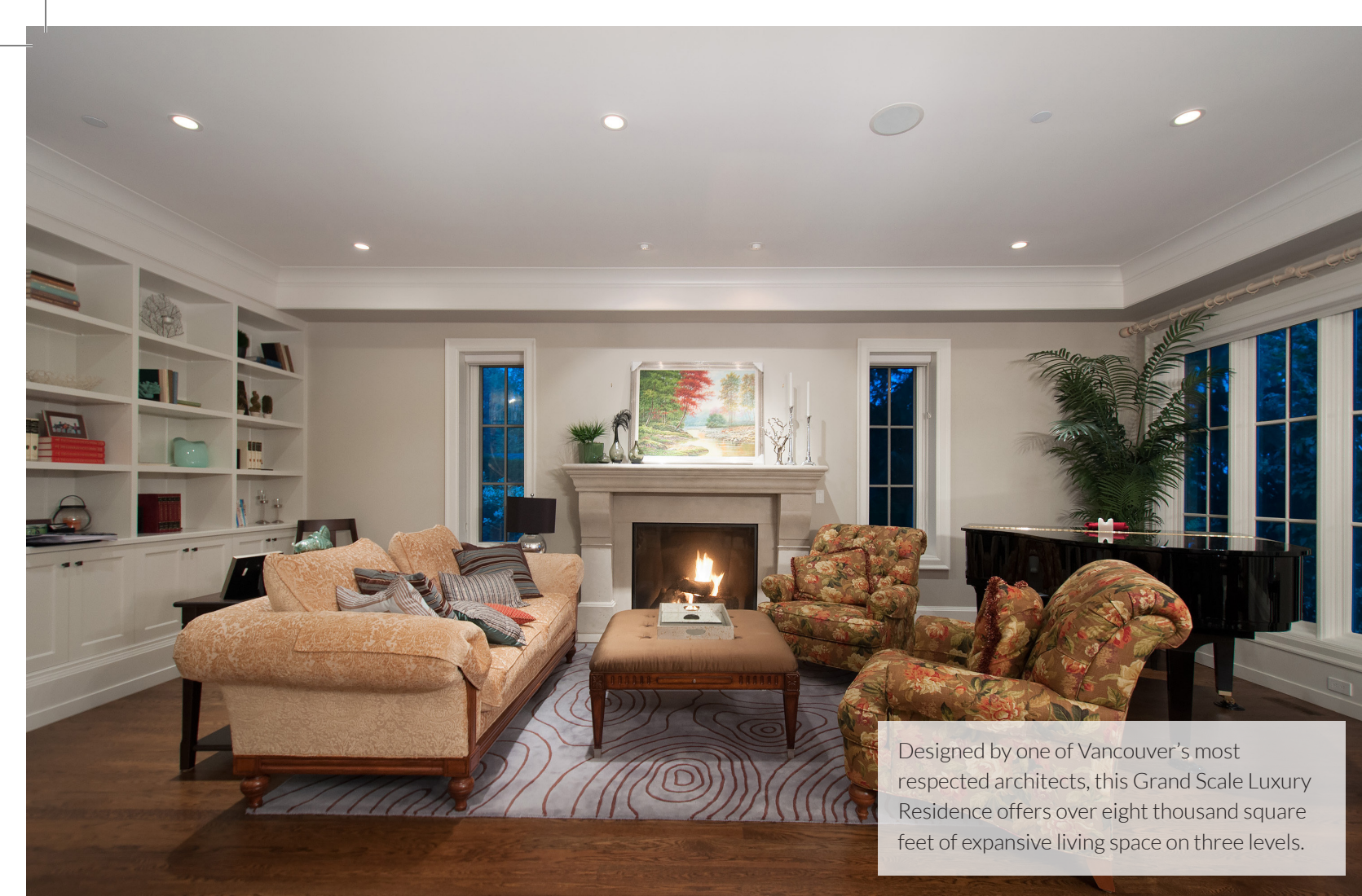
Designed by one of Vancouver's most respected architects, this Grand Scale Luxury Residence offers over eight thousand square feet of expansive living space on three levels.