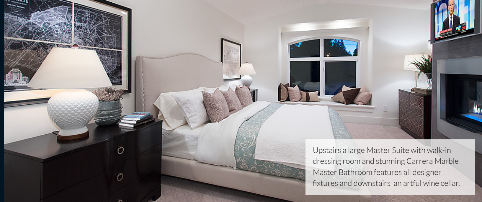
Upstairs a large Master Suite with walk-in dressing room and stunning Carrera Marble Master Bathroom features all designer fixtures and downstairs an artful wine cellar.