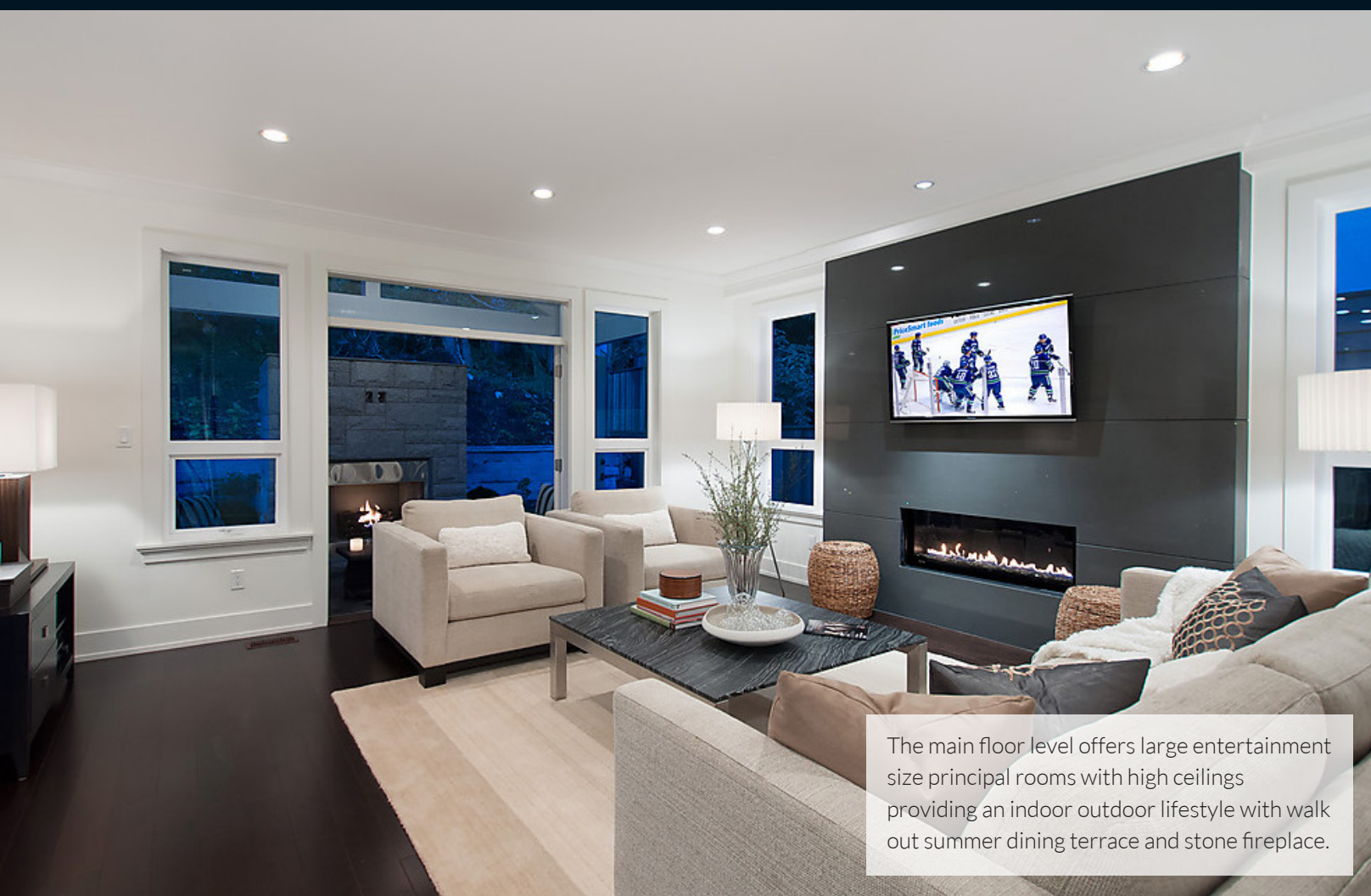
The main floor level offers large entertainment size principal rooms with high ceilings providing an indoor outdoor lifestyle with walk out summer dining terrace and stone fireplace.