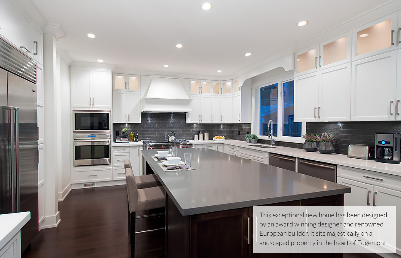
This exceptional new home has been designed by an award winning designer and renowned European builder. It sits majestically on a landscaped property in the heart of Edgemont.