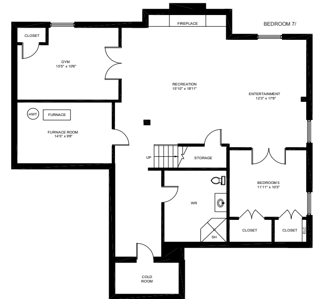
LOWER FLOOR ( 1602 sq.ft.) Ceiling Height: 7'5"

This floor plan is provided for illustrative purposes only. Buyer to verify measurements.