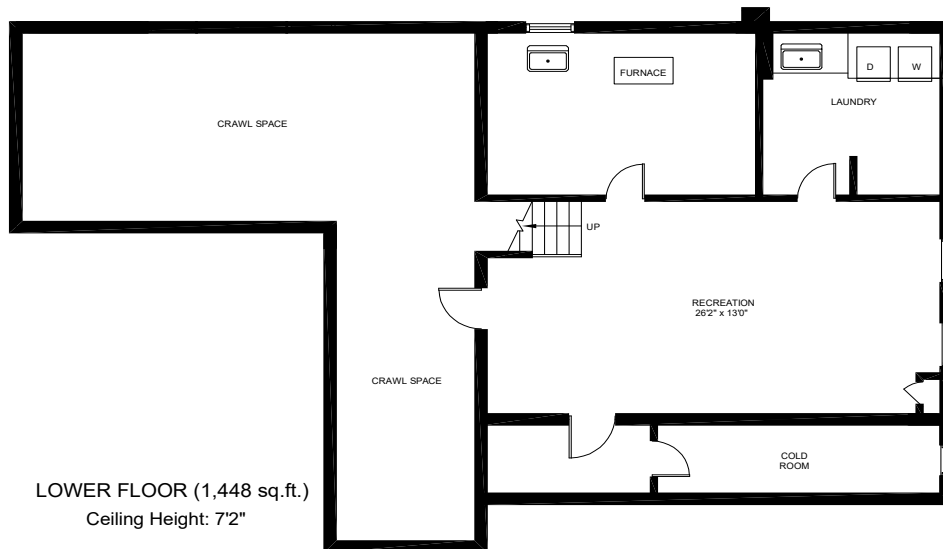
LOWER FLOOR (1,448 sq.ft.) Ceiling Height: 7'2"

This floor plan is provided for illustrative purposes only. Buyer to verify measurements.