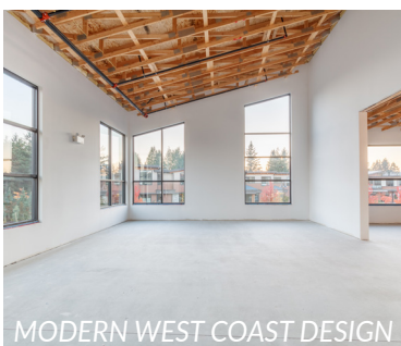
MODERN WEST COAST DESIGN