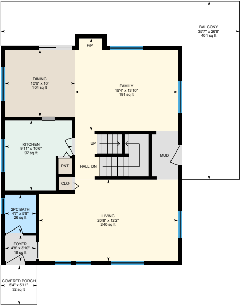
Main Floor Exterior Area 893.72 sq ft