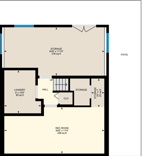
Basement (8ft 1in) Exterior Area 833.54 sq ft