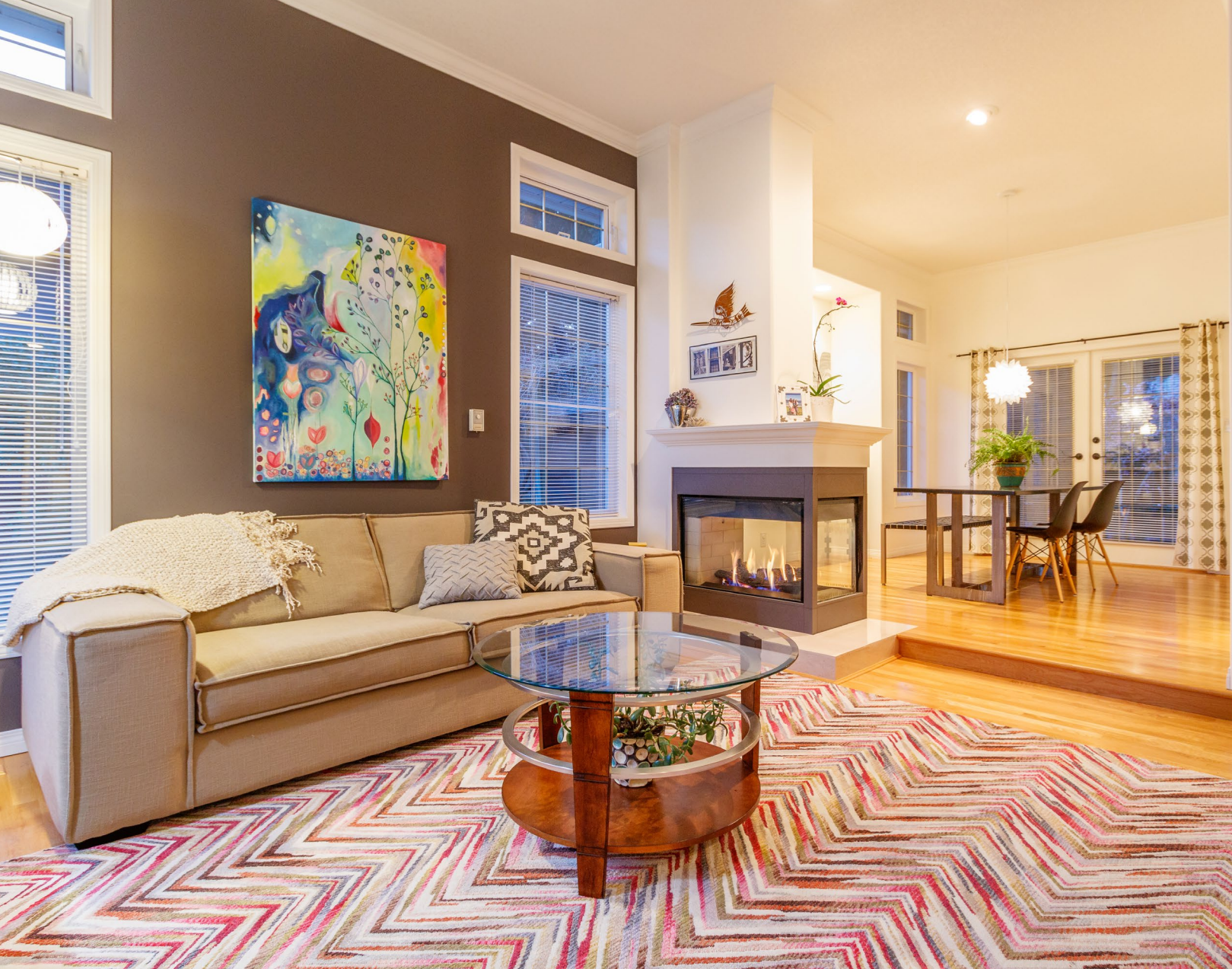
MAIN FLOOR 1296 SQ. FT.