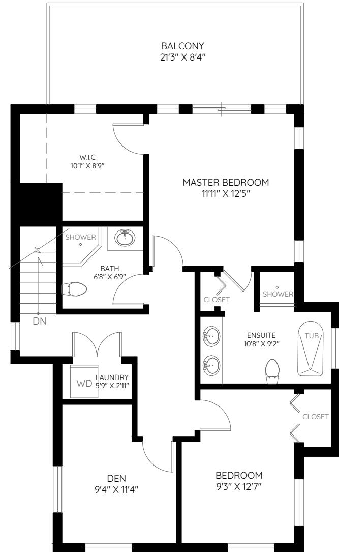
UPPER 806 SQ.FT.