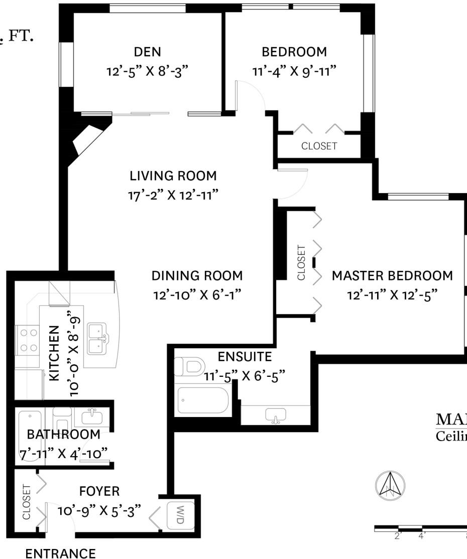
MAIN FLOOR PLAN Ceiling Height: 7'-11"