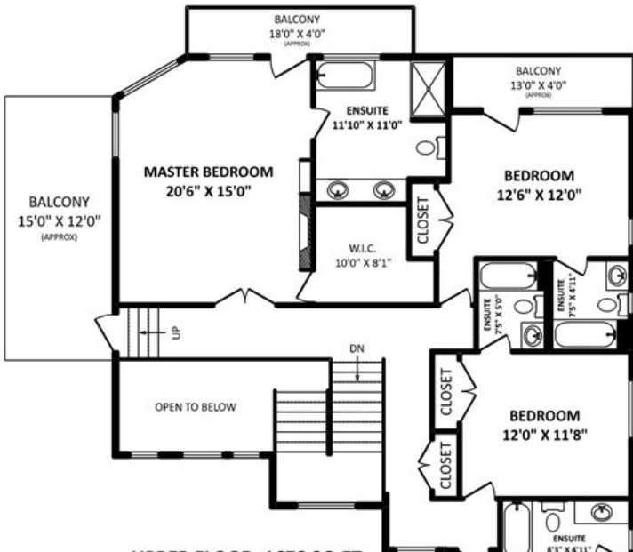
UPPER FLOOR: 1678 SQ.FT.