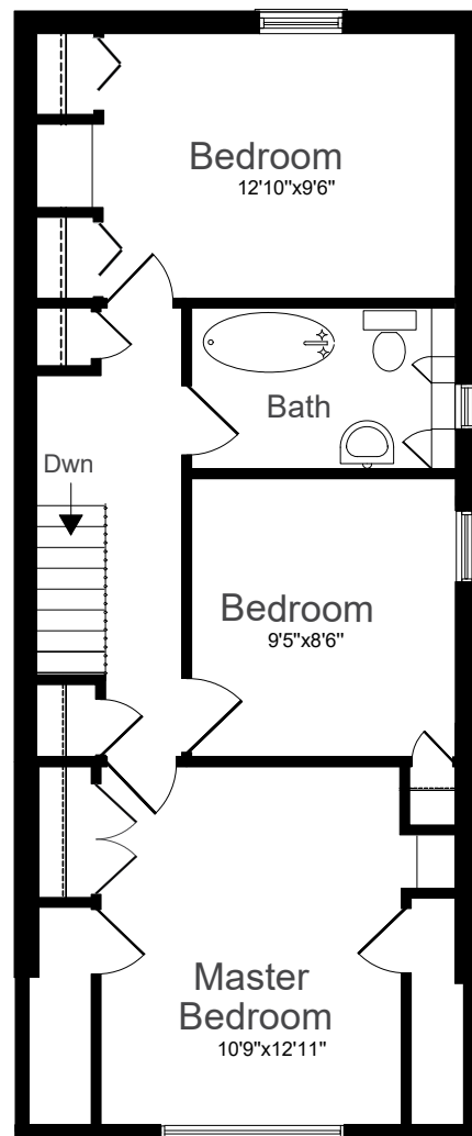
2ND FLOOR 690 sq ft