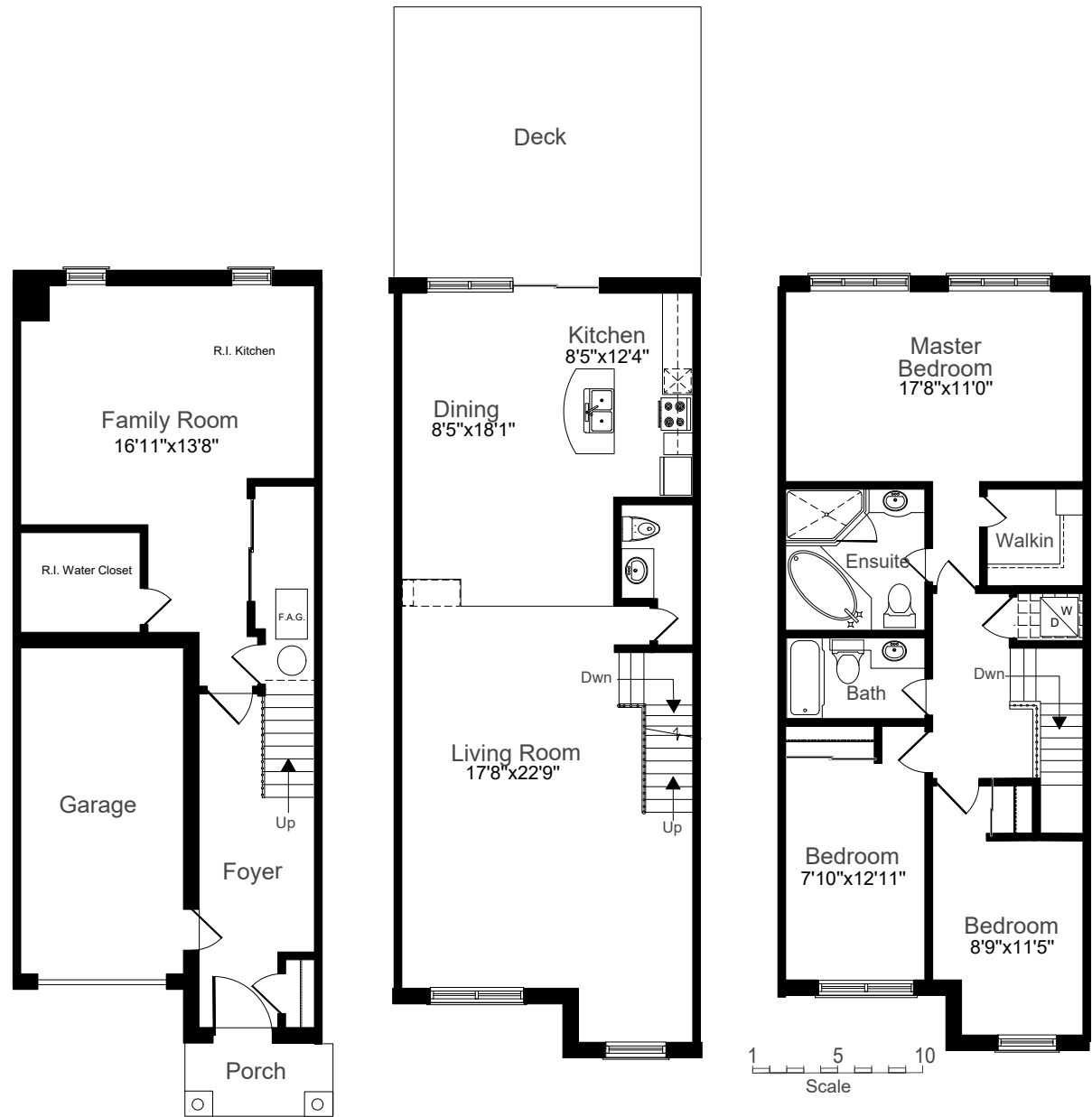
BASEMENT LEVEL 600 sq ft