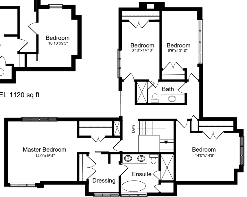
2ND FLOOR 1470 sq ft