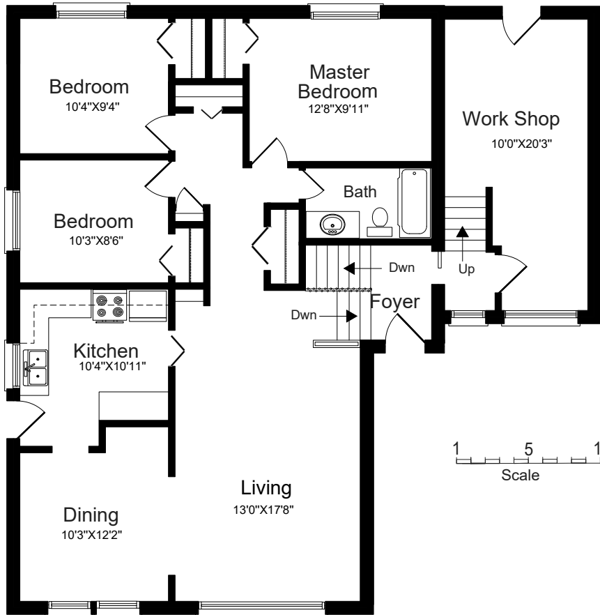
MAIN FLOOR 1450 sq ft