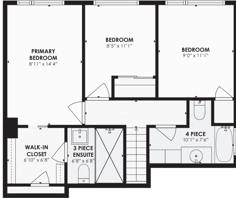
2ND LEVEL 560 sq. ft.