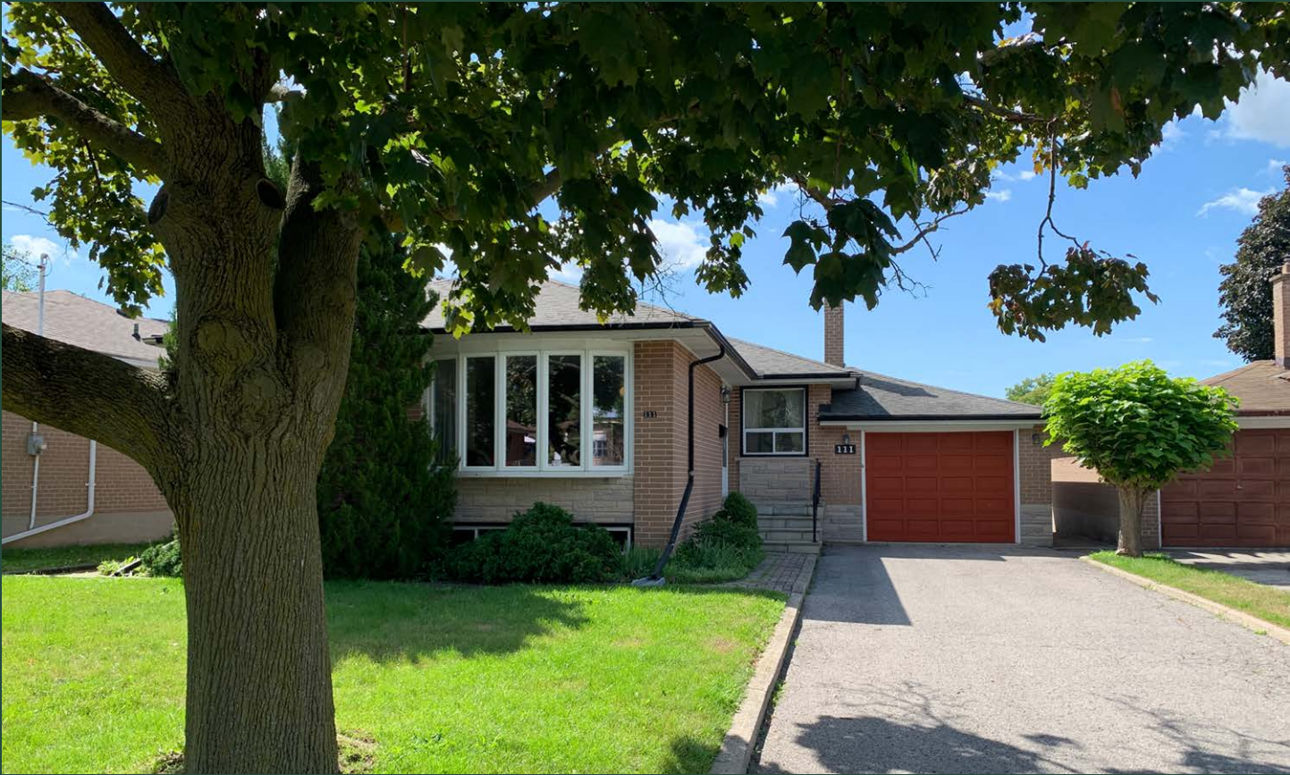
111 Broadlands Boulevard