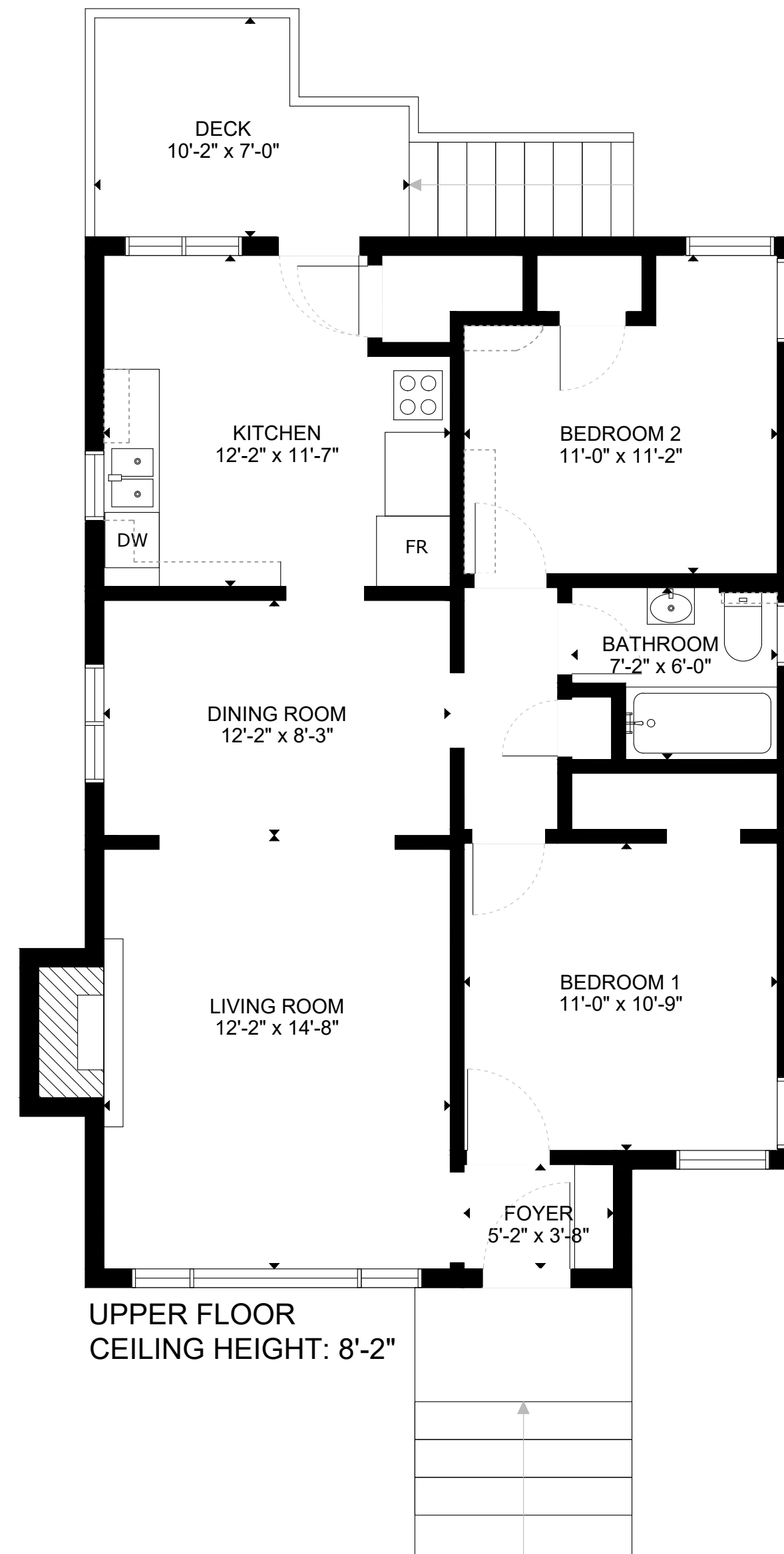
UPPER FLOOR CEILING HEIGHT: 8'-2"