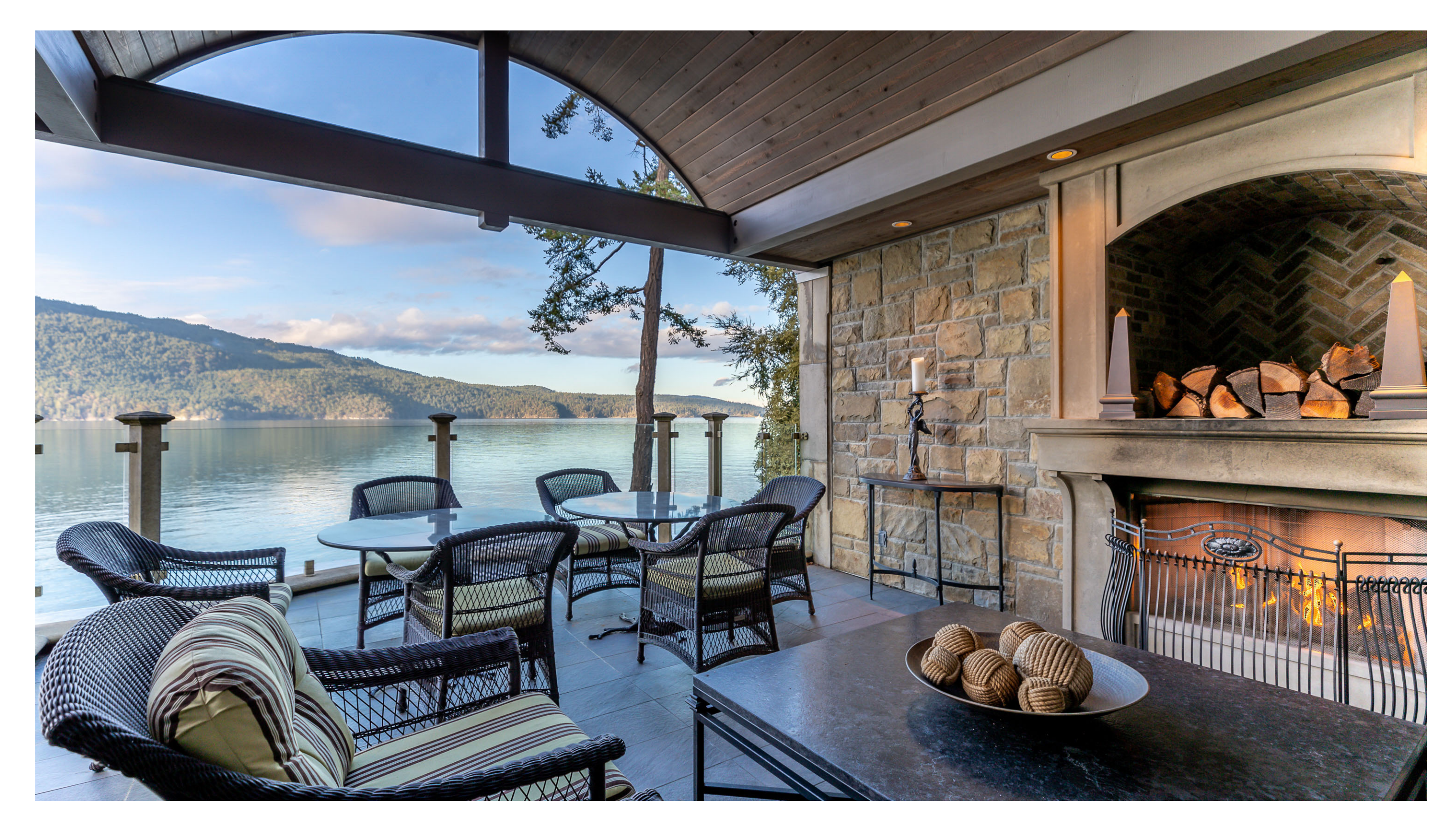
EAST-WING TERRACE Barrelled ceiling, built-in heaters, its own stone fireplace, and a cozy seating and dining area