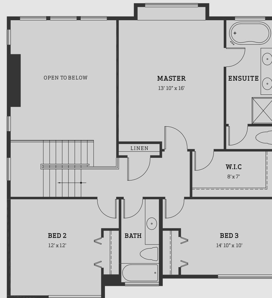
2 UPPER FLOOR