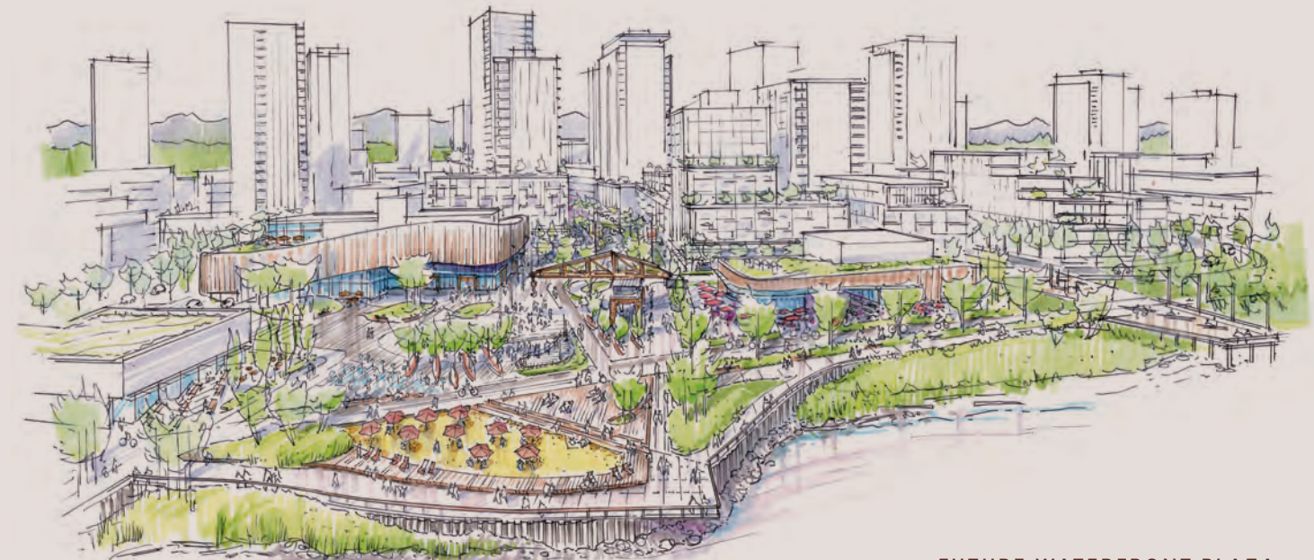
FUTURE WATERFRONT PLAZA

Located on River District Crossing, Harlin is perfectly poised to take advantage of the energy and excitement that's on its way. Stroll the new retail shops and cafés that will be lining River District Crossing. Connect with friends at the waterfront plaza, then head for a unique dining experience at the water's edge. Feeling a tad more energetic? Get those endorphins pumping at the brand new community centre complete with fitness centre, indoor racquet courts, and multi-purpose rooms. At Harlin, you can rest and relax, play and participate, explore and experience. It's the best of all worlds on your doorstep.