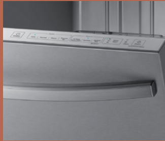
Digital Touch Controls

Dishwasher with Integrated Digital Touch Controls