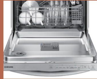
Stainless Steel Interior Door