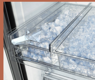
Dual Ice Maker with Cubed Ice and IceBites™