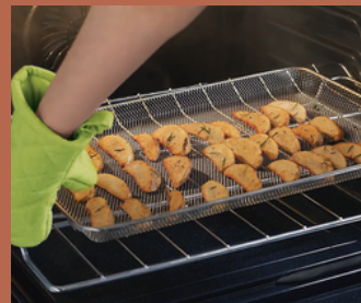
No Preheat Air Fry