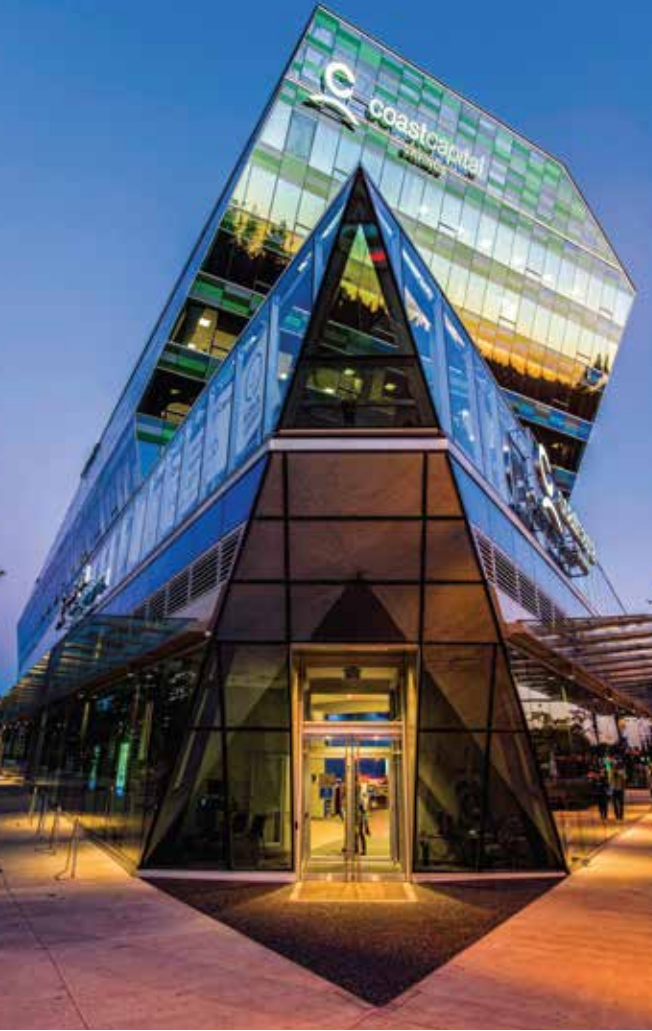
Coast Capital HQ