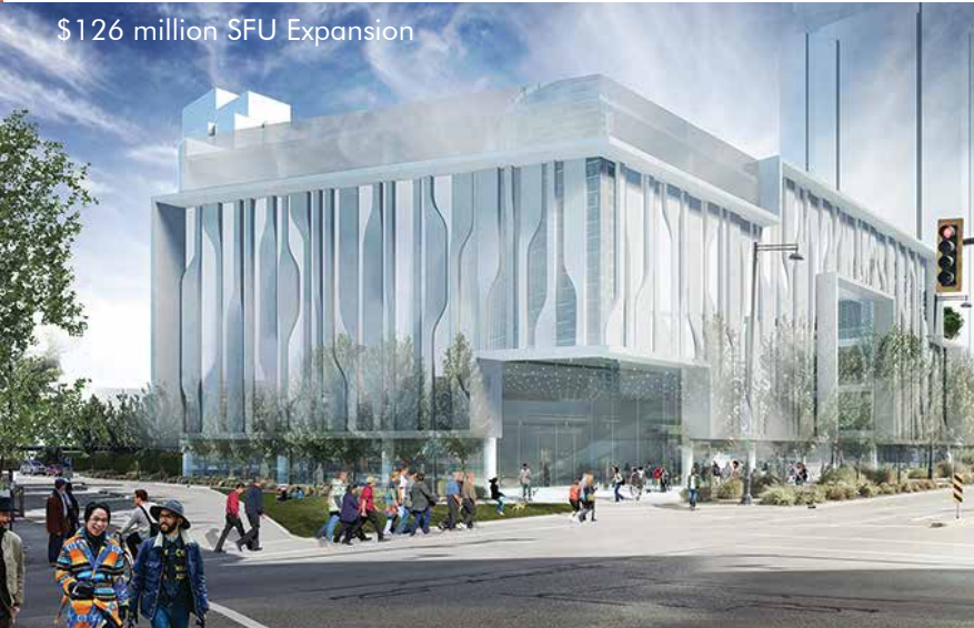
$126 million SFU Expansion