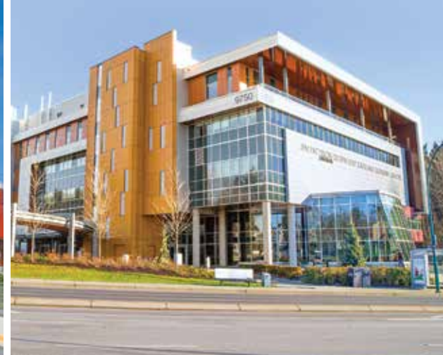
Jim Pattison Outpatient Care & Surgery Centre