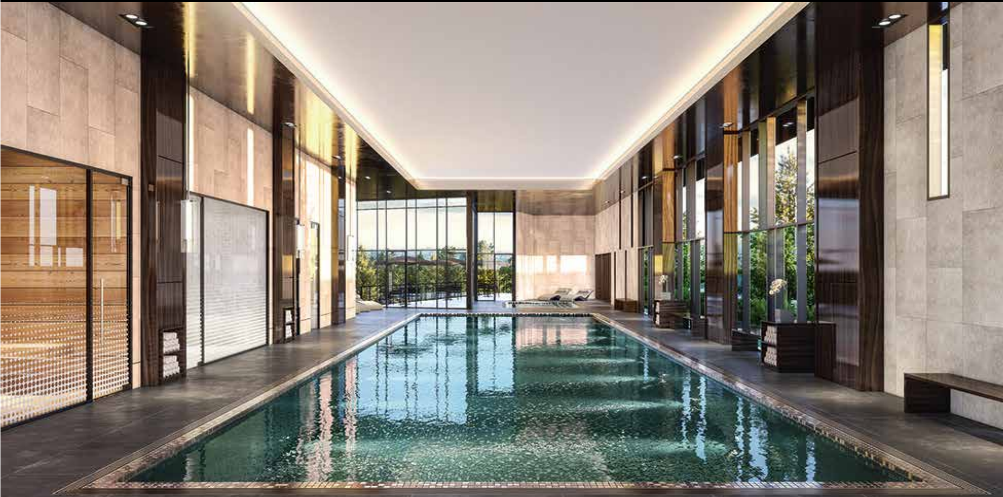
BOULEVARD SPA: Pool, tepidarium, sauna and steam room, hot tub, sun deck, and experience shower.

ALL RENDERINGS REFLECT THE ARTISTS' INTERPRETATION OF THE PROJECT ONLY AND DO NOT TAKE INTO ACCOUNT THE NEIGHBOURING BUILDINGS, PHYSICAL STRUCTURES, STREETS AND LANDSCAPES. THIS IS NOT AN OFFERING FOR SALE. ANY SUCH OFFERING MAY ONLY BE MADE WITH THE APPLICABLE DISCLOSURE STATEMENT AND AGREEMENT OF PURCHASE AND SALE. CONCORD PARK BOULEVARD LIMITED PARTNERSHIP. E. & O.E.