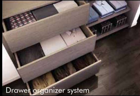
Drawer organizer system