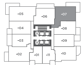
7TH - 40TH FLOOR