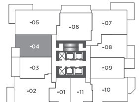
7TH - 40TH FLOOR