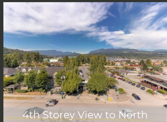
4th Storey View to North