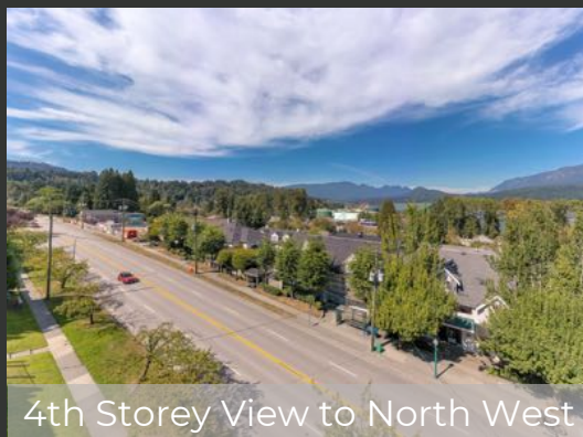
4th Storey View to North West