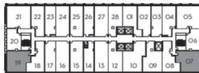
FLOORS 3 - 7