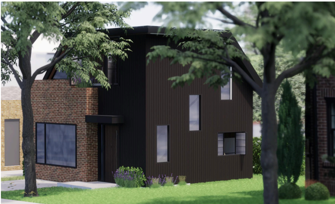
2-storey garden suite from Toronto's Eva Lanes - www.evalanes.com

The new building is a mostly-autonomous auxiliary dwelling unit, normally up to 6.0m (19.68 feet) tall, that cannot be legally severed from the main property, but is permitted a wide variety of uses, including as a revenue-producing (rental) unit. Where practical, some will have optional indoor vehicle parking.