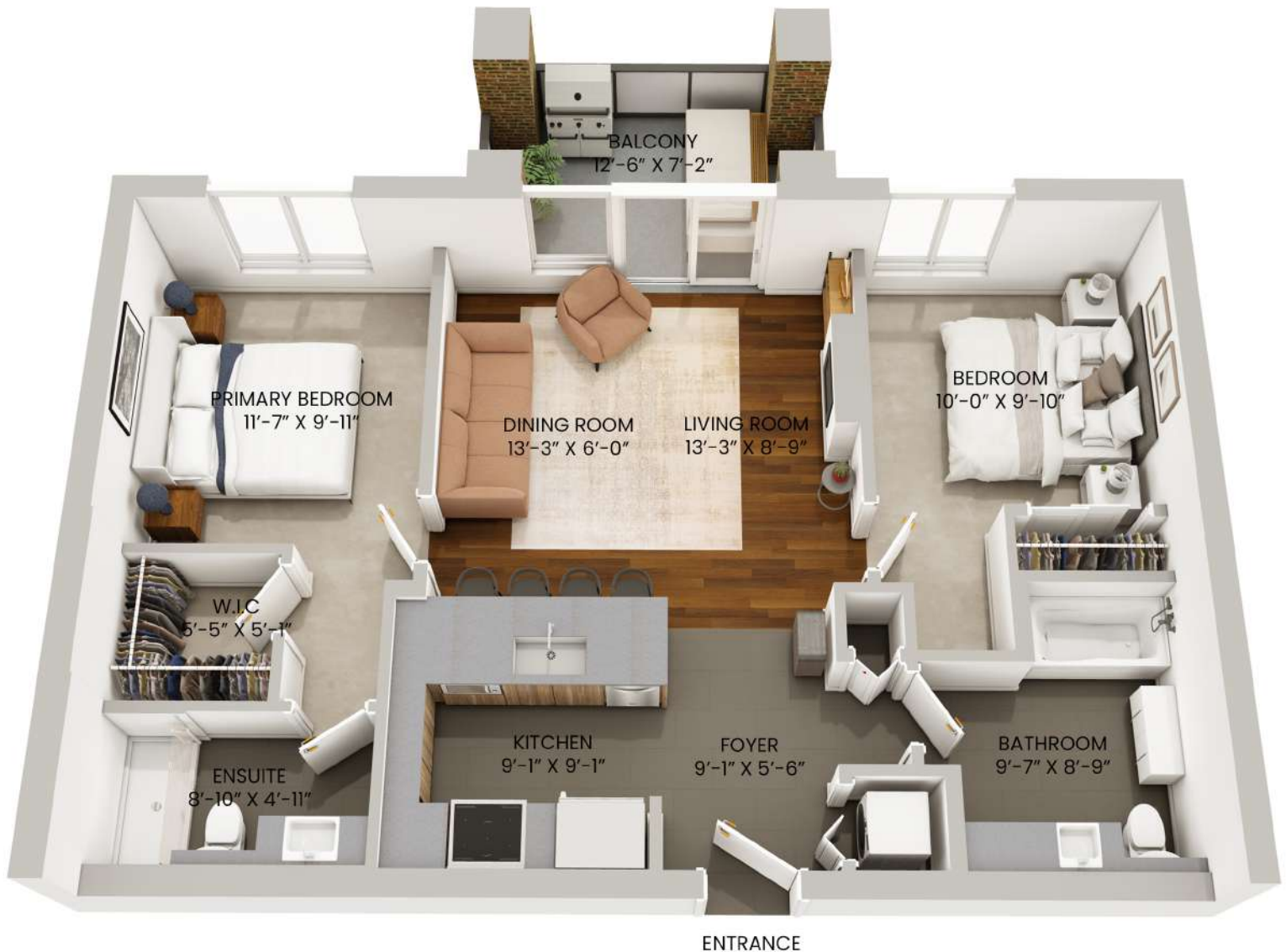
MAIN FLOOR PLAN Ceiling Height: 8'-8"