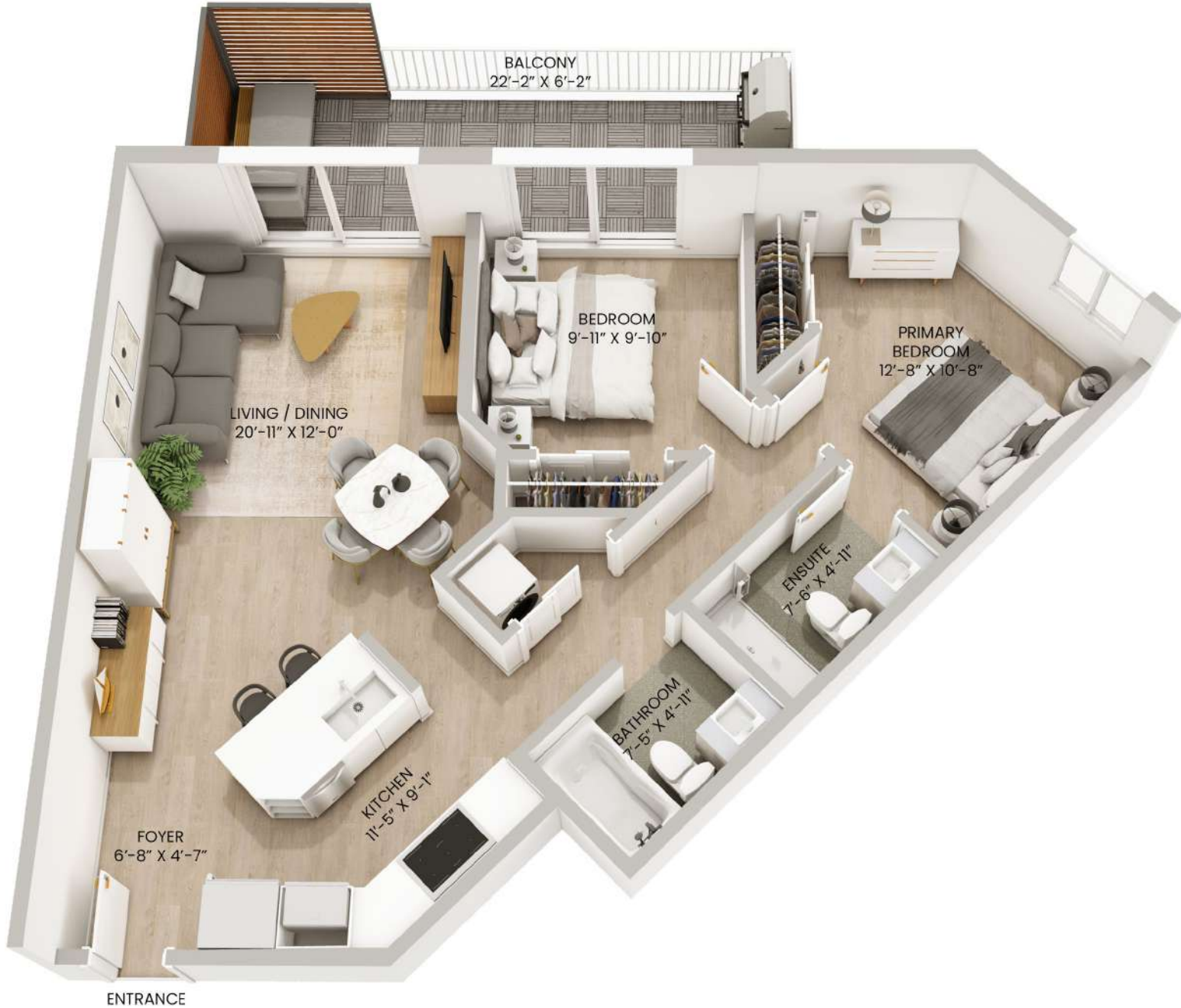
MAIN FLOOR PLAN Ceiling Height: 8'-0"

MAIN FLOOR TOTAL: 810 SQ.FT. BALCONY: 137 SQ. FT.