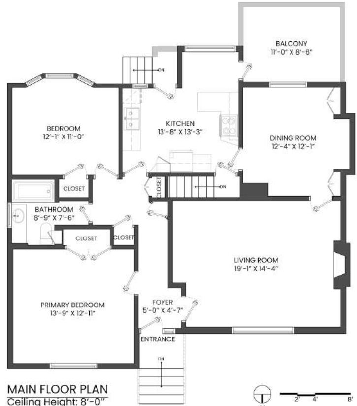
MAIN FLOOR PLAN Ceiling Height: 8'-0"